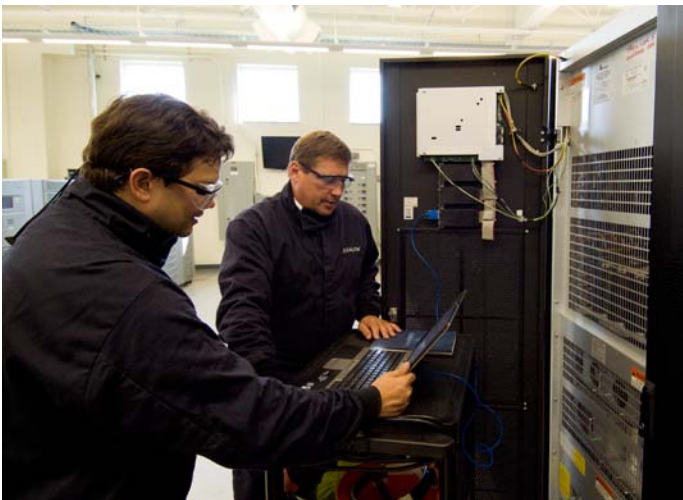
Emerson field technicians can isolate the root cause of power quality problems and recommend solutions to protect your mission critical data center systems.

Dips, spikes, surges, or outages can damage computers and other critical systems in your data center, causing them to malfunction, shut down unexpectedly or fail prematurely. Grounding errors, transient voltage and harmonic distortion are a few of the issues that may affect power system quality and reliability. Isolating these problems can help you improve your data center availability.