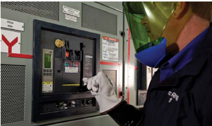
Proper Arc Flash labels are required on electrical equipment.